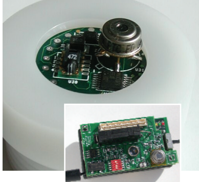
Whether a mote has a circular circuit board or a rectangular construction, it fits easily in the palm of your hand.

One instance of a sparse regional wireless sensor network is the 32 devices on Great Duck Island, Maine that monitor temperature, humidity, barometric pressure, and mid-range infrared radiation both in and near Leach's Storm Petrel nesting burrows