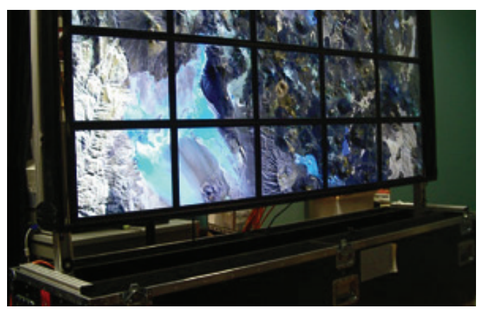
FIGURE 2 GeoWall II's 15-panel display contains 25 million pixels and, like the original GeoWall, supports stereoscopic visualization.