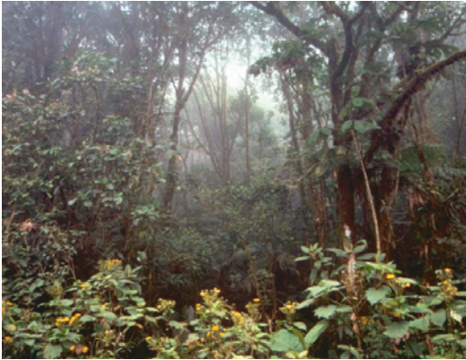
A view of the canopy from the tropical forest floor in Colombia. Areas such as this are study sites for Jarvis.

ature, and solar radiation because all three influence the moisture and sunlight available to the trees. (Soil nutrients are homogenous enough across the study areas to be excluded from the model.)