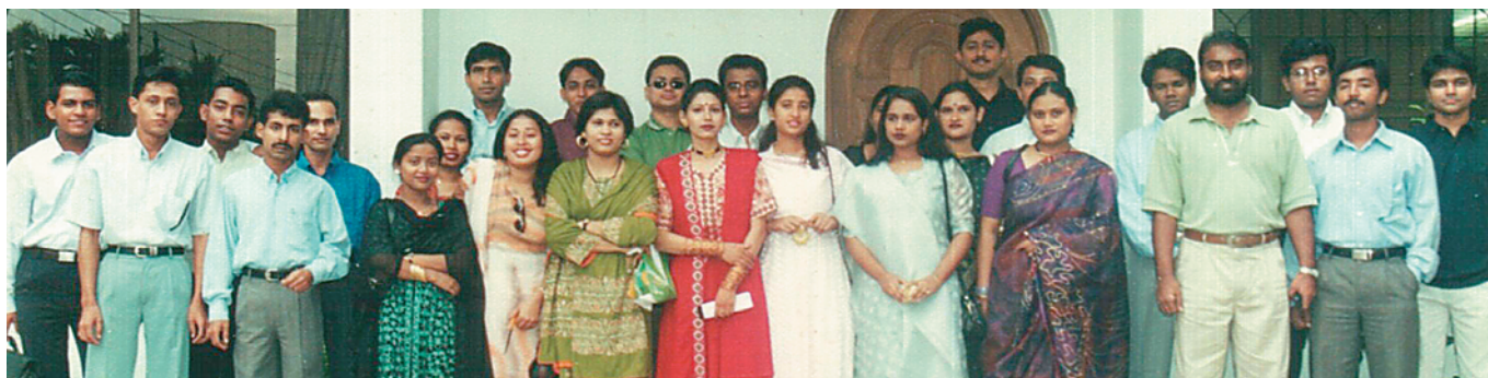
Compu-Links' partner company in Bangladesh currently staffs two dozen trained GIS specialists.